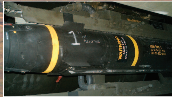
LEFT: The first operational Hellfire.