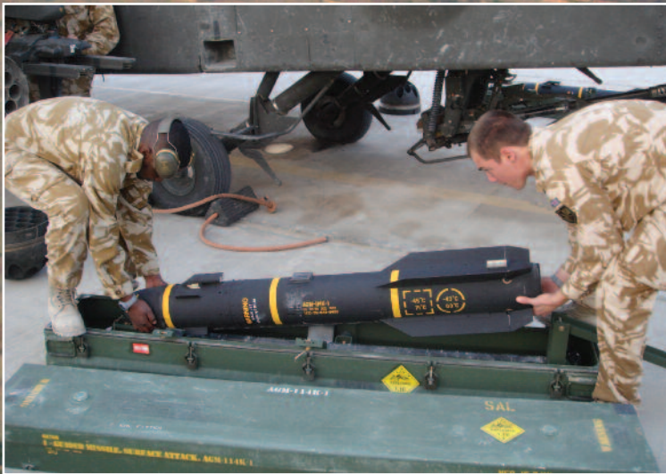
MAIN IMAGE: Looking south over Now Zad town.