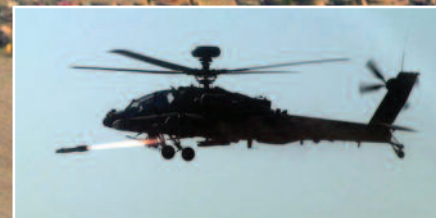
ABOVE RIGHT: A Hellfire slips off the rail.