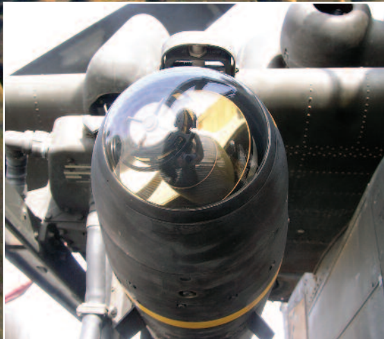
LEFT: Hellfire laser seeker.