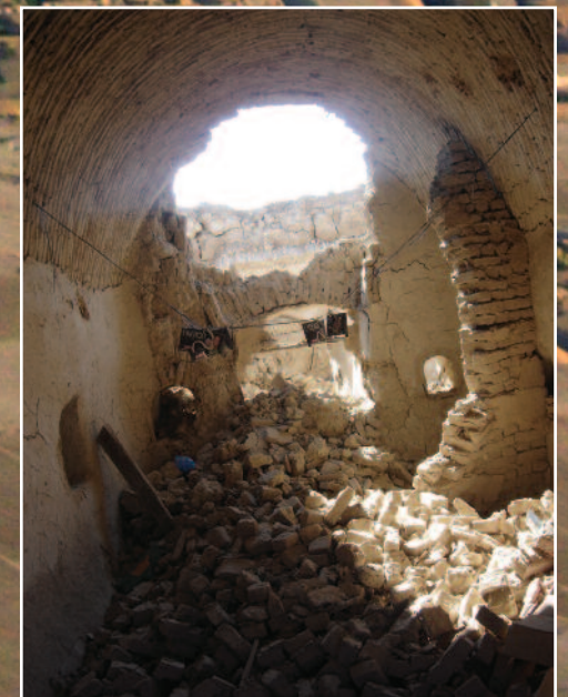
RIGHT: Damage from a Hellfire.